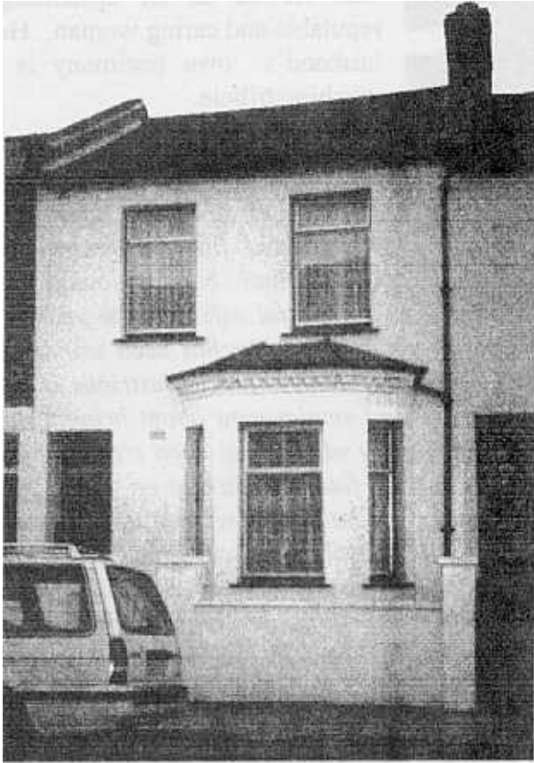
The old Parker terrace home, 116 Foxberry, Brockley, south- east London.

the soul of a family historian, and my uncle urged me to help myself.