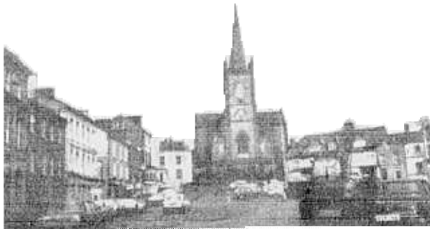
The town square of Clones, Monaghan, in 1983.